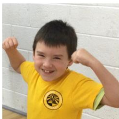
Interhouse Dodgeball. Congratulations to the winners, Poldark